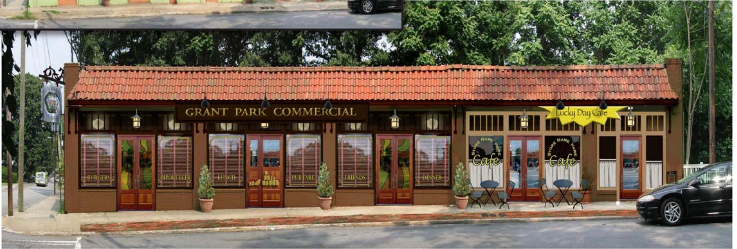
(Below) Proposed Design

760 Confederate Avenue, SE, Atlanta, GA 30312