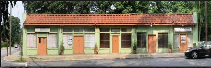
(Left) Current Condition